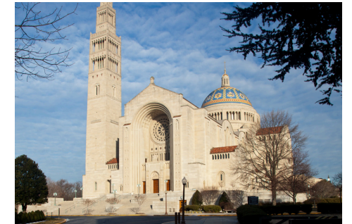
BASILICA OF THE NATIONAL SHRINE OF THE IMMACULATE CONCEPTION